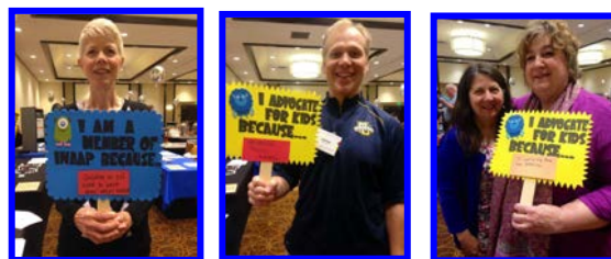
INAAP Members hold signs "I Am An INAAP Member Because ___; or I Advocate For Children Because ___" at INAAP's Annual Meeting Booth